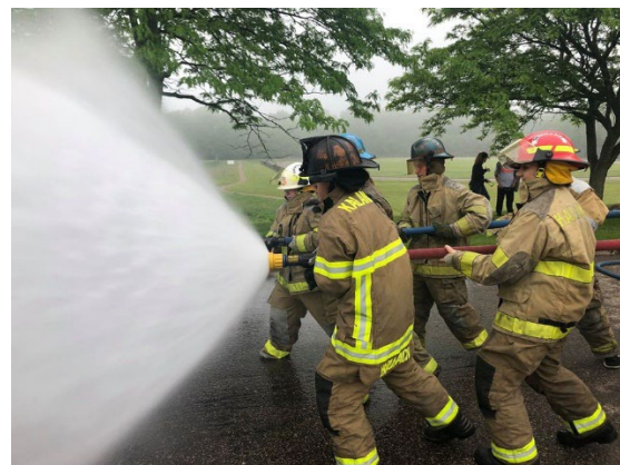
Public Safety Officer Training